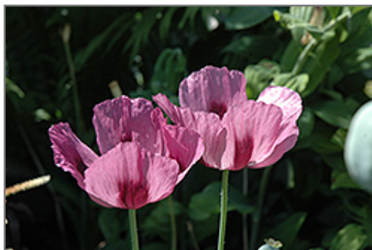
Patty's Plum Poppy flowers