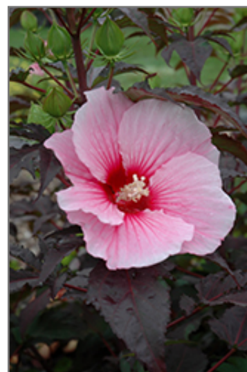
Summer Storm Hibiscus flowers

Glossy, maple-like, near-black leaves make a bold statement even before the showy, gigantic ruffled pink flowers come into bloom; ideal for the mixed garden border or in mass; do not allow to dry to wilting point