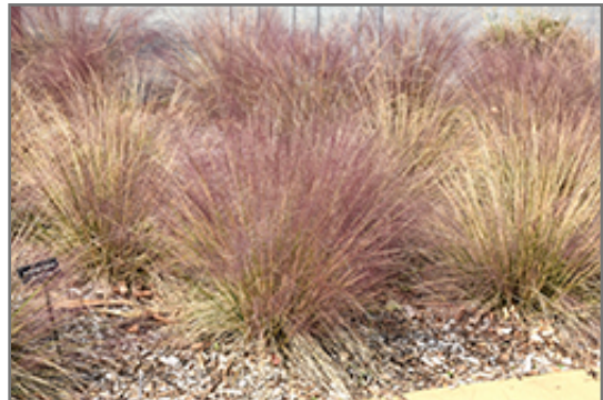
Hairawn Muhly in fall

33 BARTLETT FARM ROAD NANTUCKET, MA 02554