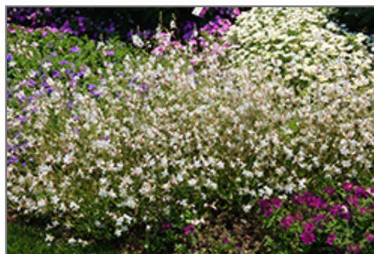
Stratosphere White Gaura in bloom