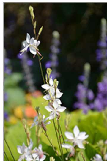
Stratosphere White Gaura flowers

This is a relatively low maintenance plant, and is best cleaned up in early spring before it resumes active growth for the season. It is a good choice for attracting butterflies to your yard, but is not particularly attractive to deer who tend to leave it alone in favor of tastier treats. It has no significant negative characteristics.