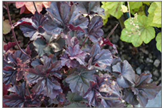
Obsidian Coral Bells foliage

Obsidian Coral Bells is recommended for the following landscape applications;