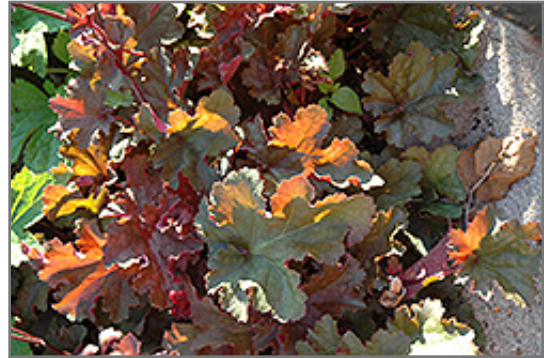
Chocolate Ruffles Coral Bells foliage

Chocolate Ruffles Coral Bells will grow to be about 10 inches tall at maturity extending to 24 inches tall with the flowers, with a spread of 12 inches. When grown in masses or used as a bedding plant, individual plants should be spaced approximately 10 inches apart. Its foliage tends to remain low and dense right to the ground. It grows at a medium rate, and under ideal conditions can be expected to live for approximately 10 years.