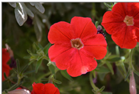
Supertunia Really Red Petunia flowers

This plant will require occasional maintenance and upkeep. Trim off the flower heads after they fade and die to encourage more blooms late into the season. It is a good choice for attracting butterflies and hummingbirds to your yard, but is not particularly attractive to deer who tend to leave it alone in favor of tastier treats. It has no significant negative characteristics.