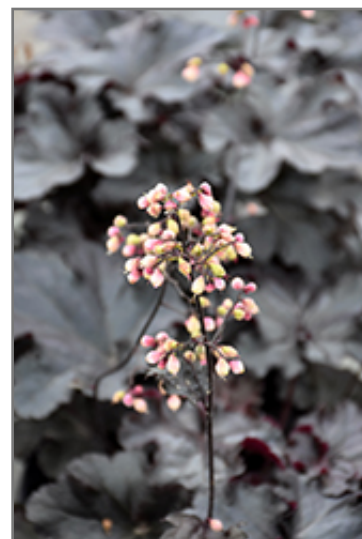
Black Pearl Coral Bells flowers