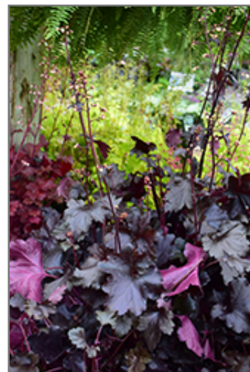
Black Pearl Coral Bells in bloom

Black Pearl Coral Bells is recommended for the following landscape applications;