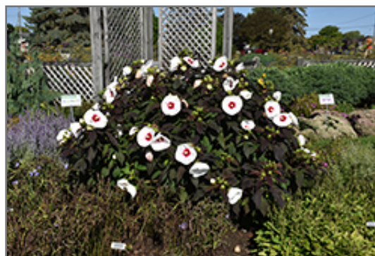
Mocha Moon Hibiscus in bloom