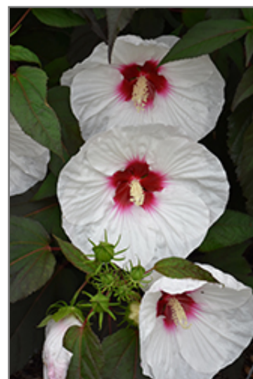
Mocha Moon Hibiscus flowers