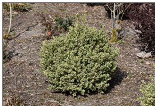
Wedding Ring Boxwood