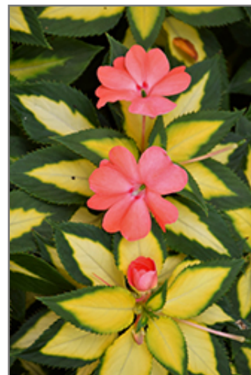
SunPatens Spreading Salmon New Guinea Impatiens flowers

This plant will require occasional maintenance and upkeep, and should not require much pruning, except when necessary, such as to remove dieback. It is a good choice for attracting bees and butterflies to your yard. It has no significant negative characteristics.