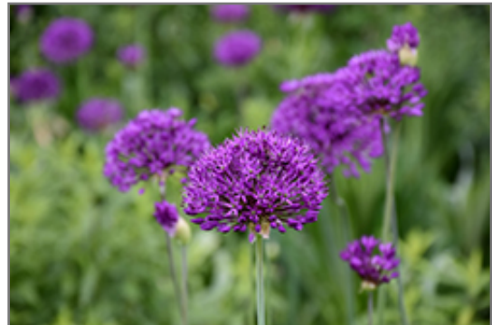
Purple Sensation Ornamental Onion flowers