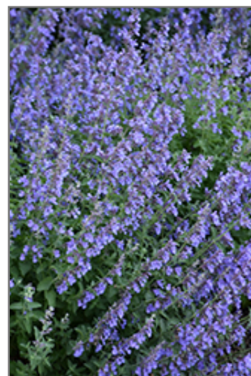
Cat's Meow Catmint flowers

Cat's Meow Catmint is recommended for the following landscape applications;