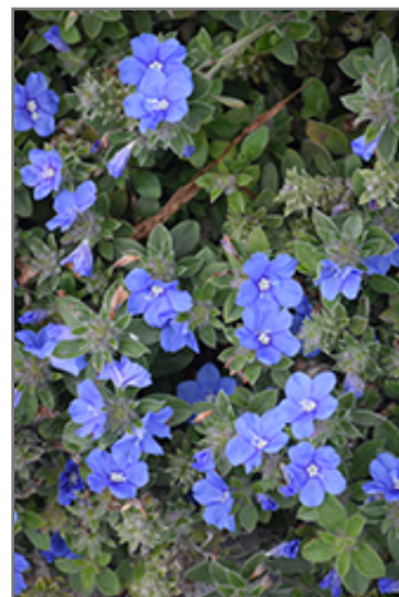
Blue My Mind Morning Glory flowers

Blue My Mind Morning Glory is recommended for the following landscape applications;