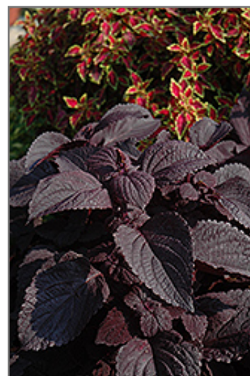
ColorBlaze Dark Star Coleus foliage