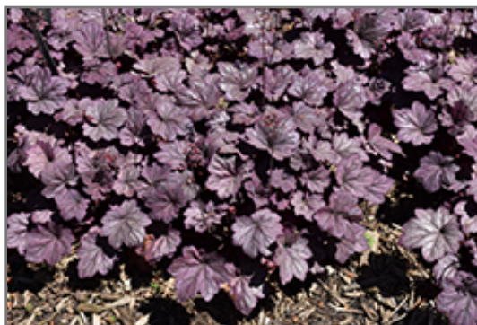
Carnival Sugar Plum Coral Bells

Carnival Sugar Plum Coral Bells will grow to be about 12 inches tall at maturity extending to 18 inches tall with the flowers, with a spread of 14 inches. When grown in masses or used as a bedding plant, individual plants should be spaced approximately 10 inches apart. Its foliage tends to remain dense right to the ground, not requiring facer plants in front. It grows at a medium rate, and under ideal conditions can be expected to live for approximately 10 years. As an evergreen perennial, this plant will typically keep its form and foliage year-round.