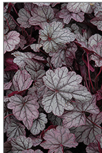
Carnival Sugar Plum Coral Bells foliage

This is a relatively low maintenance plant, and should be cut back in late fall in preparation for winter. It is a good choice for attracting hummingbirds to your yard. It has no significant negative characteristics.