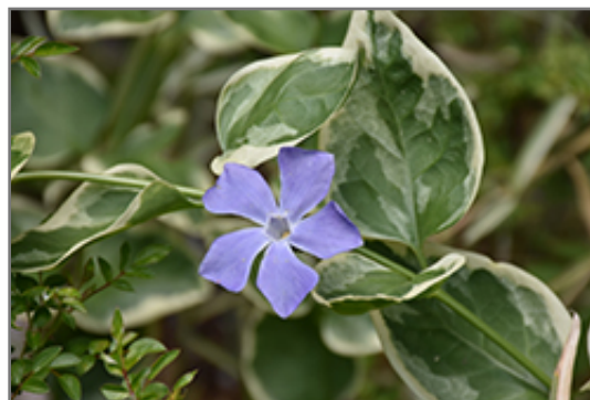
Variegated Periwinkle flowers