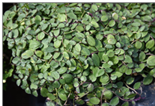
County Park Star Creeper foliage