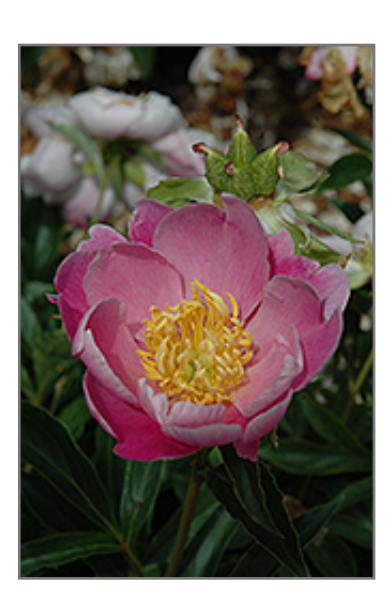
Apple Blossom Peony flowers

Apple Blossom Peony will grow to be about 30 inches tall at maturity, with a spread of 3 feet. When grown in masses or used as a bedding plant, individual plants should be spaced approximately 30 inches apart. The flower stalks can be weak and so it may require staking in exposed sites or excessively rich soils. It grows at a slow rate, and under ideal conditions can be expected to live for approximately 20 years. As an herbaceous perennial, this plant will usually die back to the crown each winter, and will regrow from the base each spring. Be careful not to disturb the crown in late winter when it may not be readily seen!