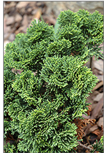
Contorta Hinoki Falsecypress foliage

Contorta Hinoki Falsecypress will grow to be about 10 feet tall at maturity, with a spread of 4 feet. It has a low canopy with a typical clearance of 1 foot from the ground, and is suitable for planting under power lines. It grows at a slow rate, and under ideal conditions can be expected to live for 70 years or more.