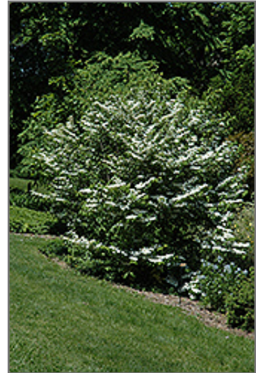
Watanabei Doublefile Viburnum in bloom

* This is a 'special order' plant - contact store for details