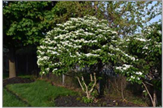
Watanabei Doublefile Viburnum in bloom

This is a relatively low maintenance shrub, and should only be pruned after flowering to avoid removing any of the current season's flowers. It is a good choice for attracting birds to your yard, but is not particularly attractive to deer who tend to leave it alone in favor of tastier treats. It has no significant negative characteristics.