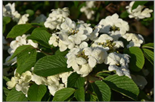
Watanabei Doublefile Viburnum flowers