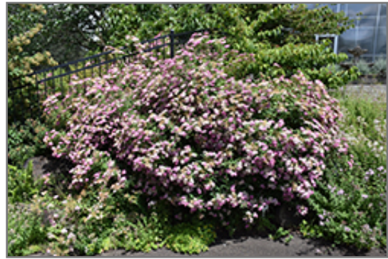
Lemon Princess Spirea in bloom

This shrub should only be grown in full sunlight. It prefers to grow in average to moist conditions, and shouldn't be allowed to dry out. It is not particular as to soil type or pH. It is highly tolerant of urban pollution and will even thrive in inner city environments. This is a selected variety of a species not originally from North America.