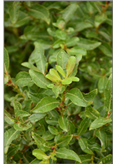
Black Pussy Willow foliage

This shrub does best in full sun to partial shade. It is quite adaptable, preferring to grow in average to wet conditions, and will even tolerate some standing water. It is not particular as to soil type or pH. It is highly tolerant of urban pollution and will even thrive in inner city environments. This is a selected variety of a species not originally from North America.