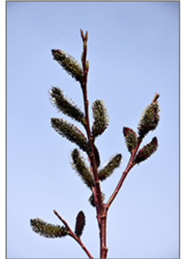
Black Pussy Willow flowers

Black Pussy Willow is recommended for the following landscape applications;