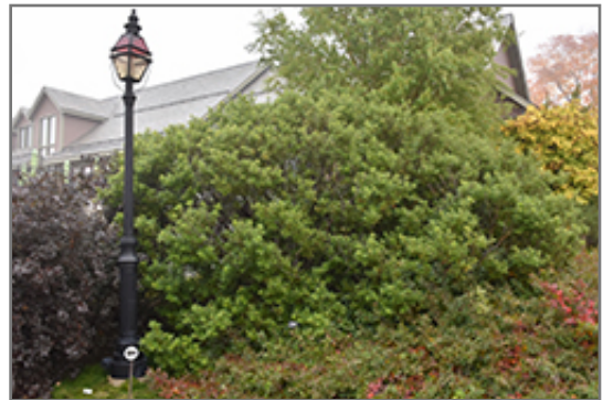
Black Pussy Willow