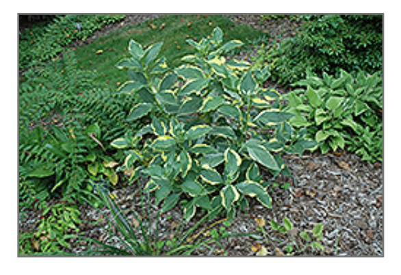
Lemon Wave Hydrangea