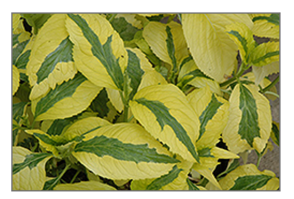
Lemon Wave Hydrangea foliage