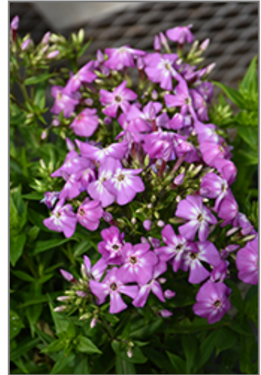
Flame Pro Violet Charm Garden Phlox flowers