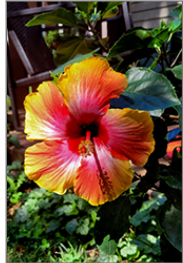
Maui Hibiscus flowers

When grown indoors, Maui Hibiscus can be expected to grow to be about 4 feet tall at maturity, with a spread of 5 feet. It grows at a fast rate, and under ideal conditions can be expected to live for approximately 5 years. This houseplant will do well in a location that gets either direct or indirect sunlight, although it will usually require a more brightly-lit environment than what artificial indoor lighting alone can provide. It requires an evenly moist well-drained soil for optimal growth, but will suffer if left to grow in standing water. The surface of the soil shouldn't be allowed to dry out completely, and so you should expect to water this plant once and possibly even twice each week. Be aware that your particular watering schedule may vary depending on its location in the room, the pot size, plant size and other conditions; if in doubt, ask one of our experts in the store for advice. To help it achieve its best flowering performance, you may periodically apply a flower-boosting fertilizer throughout the active blooming season. It is not particular as to soil pH, but grows best in rich soil. Contact the store for specific recommendations on pre-mixed potting soil for this plant.