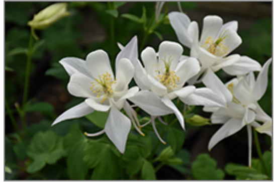
Earlybird White Columbine flowers

Earlybird White Columbine is recommended for the following landscape applications;