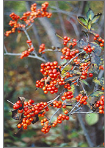
Orange-Berried Winterberry fruit