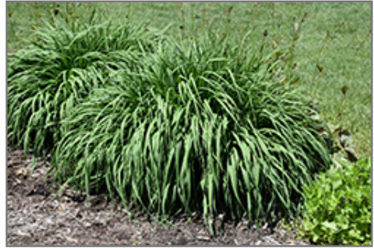
Transparent Moor Grass