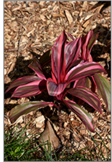
Electra Hawaiian Ti Plant

When grown indoors, Electra Hawaiian Ti Plant can be expected to grow to be about 24 inches tall at maturity, with a spread of 24 inches. It grows at a medium rate, and under ideal conditions can be expected to live for approximately 10 years. This houseplant will do well in a location that gets either direct or indirect sunlight, although it will usually require a more brightly-lit environment than what artificial indoor lighting alone can provide. It does best in average to evenly moist soil, but will not tolerate standing water. The surface of the soil shouldn't be allowed to dry out completely, and so you should expect to water this plant once and possibly even twice each week. Be aware that your particular watering schedule may vary depending on its location in the room, the pot size, plant size and other conditions; if in doubt, ask one of our experts in the store for advice. It will benefit from a regular feeding with a general-purpose fertilizer with every second or third watering. It is not particular as to soil type or pH; an average potting soil should work just fine.