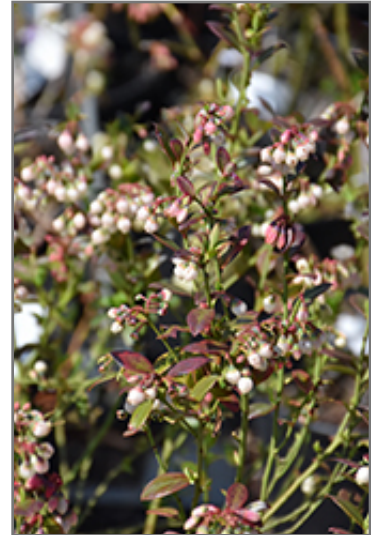
Buckle Blueberry flowers

This is a multi-stemmed evergreen shrub with a mounded form. Its average texture blends into the landscape, but can be balanced by one or two finer or coarser trees or shrubs for an effective composition. This is a relatively low maintenance plant, and usually looks its best without pruning, although it will tolerate pruning. It is a good choice for attracting birds to your yard. It has no significant negative characteristics.