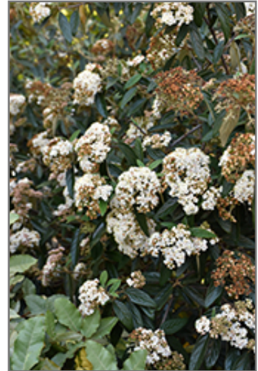
Decker Prague Viburnum flowers