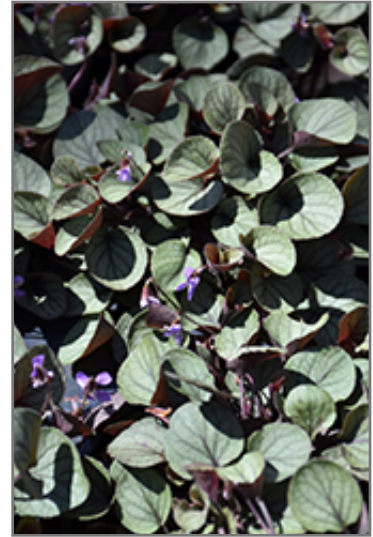
Silver Gem Pansy flowers

A beautiful mat forming groundcover presenting silver-green foliage topped with dainty light purple flowers; thrives in shaded garden beds, borders or containers; drought tolerant once established