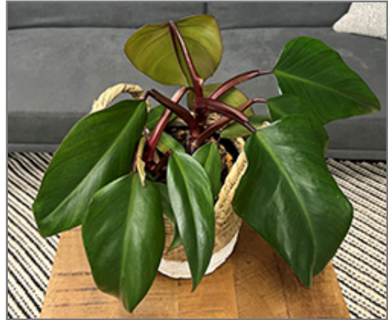
Dark Lord Philodendron in full

When grown indoors, Dark Lord Philodendron can be expected to grow to be about 6 feet tall at maturity, with a spread of 3 feet. It grows at a fast rate, and under ideal conditions can be expected to live for approximately 10 years. This houseplant will do well in a location that gets either direct or indirect sunlight, although it will usually require a more brightly-lit environment than what artificial indoor lighting alone can provide. It prefers to grow in average to moist soil. The surface of the soil shouldn't be allowed to dry out completely, and so you should expect to water this plant once and possibly even twice each week. Be aware that your particular watering schedule may vary depending on its location in the room, the pot size, plant size and other conditions; if in doubt, ask one of our experts in the store for advice. It will benefit from a regular feeding with a general-purpose fertilizer with every second or third watering. It is not particular as to soil type or pH; an average potting soil should work just fine. Be warned that parts of this plant are known to be toxic to humans and animals, so special care should be exercised if growing it around children and pets.