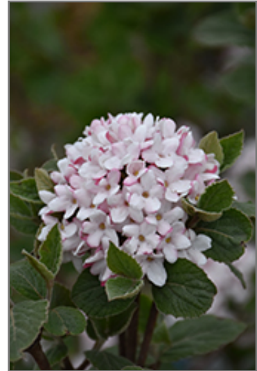
Sugar n' Spice Koreanspice Viburnum flowers