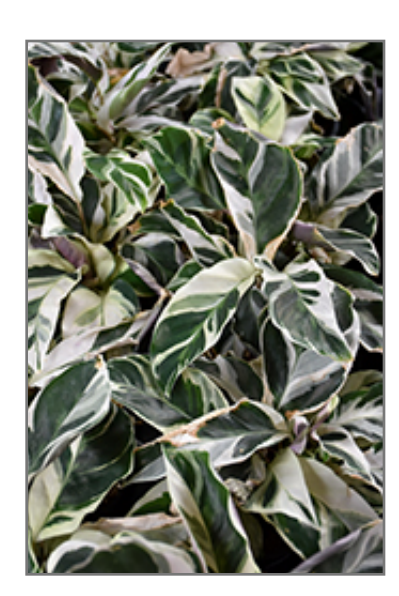
White Fusion Calathea foliage

When grown indoors, White Fusion Calathea can be expected to grow to be about 24 inches tall at maturity, with a spread of 24 inches. It grows at a slow rate, and under ideal conditions can be expected to live for approximately 5 years. This houseplant should only be grown away from direct sunlight or in a room with strong artificial light. It does best in average to evenly moist soil, but will not tolerate standing water. The surface of the soil shouldn't be allowed to dry out completely, and so you should expect to water this plant once and possibly even twice each week. Be aware that your particular watering schedule may vary depending on its location in the room, the pot size, plant size and other conditions; if in doubt, ask one of our experts in the store for advice. It will benefit from a regular feeding with a general-purpose fertilizer with every second or third watering. It is not particular as to soil pH, but grows best in rich soil. Contact the store for specific recommendations on pre-mixed potting soil for this plant.