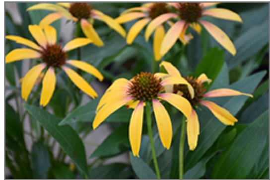
Fiery Meadow Mama Coneflower flowers

Fiery Meadow Mama Coneflower is recommended for the following landscape applications;