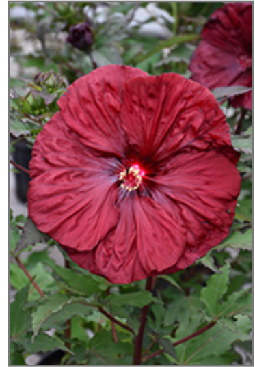
Blackberry Merlot Hibiscus flowers