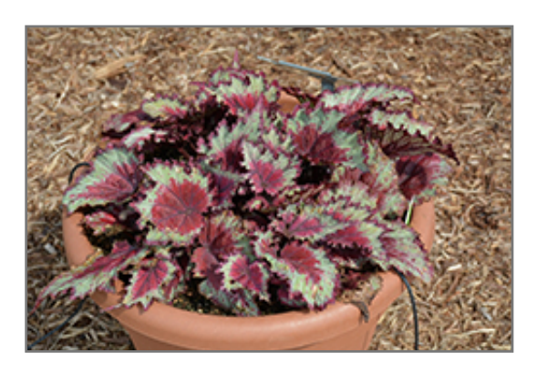
Jurassic Red Splash Begonia

When grown indoors, Jurassic Red Splash Begonia can be expected to grow to be about 16 inches tall at maturity, with a spread of 18 inches. It grows at a medium rate, and under ideal conditions can be expected to live for approximately 3 years. This houseplant performs well in both bright or indirect sunlight and strong artificial light, and can therefore be situated in almost any well-lit room or location. It is very adaptable to both dry and moist soil, but will not tolerate any standing water. The surface of the soil shouldn't be allowed to dry out completely, and so you should expect to water this plant once and possibly even twice each week. Be aware that your particular watering schedule may vary depending on its location in the room, the pot size, plant size and other conditions; if in doubt, ask one of our experts in the store for advice. It is not particular as to soil pH, but grows best in rich soil. Contact the store for specific recommendations on pre-mixed potting soil for this plant.