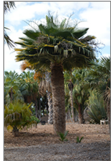
Old Man Palm

Old Man Palm is a fine choice for the yard, but it is also a good selection for planting in outdoor pots and containers. Because of its height, it is often used as a 'thriller' in the 'spiller-thriller-filler' container combination; plant it near the center of the pot, surrounded by smaller plants and those that spill over the edges. It is even sizeable enough that it can be grown alone in a suitable container. Note that when grown in a container, it may not perform exactly as indicated on the tag - this is to be expected. Also note that when growing plants in outdoor containers and baskets, they may require more frequent waterings than they would in the yard or garden.