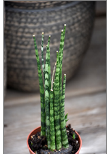
Mikado Cylindrical Snake Plant

When grown indoors, Mikado Cylindrical Snake Plant can be expected to grow to be about 3 feet tall at maturity, with a spread of 18 inches. It grows at a slow rate, and under ideal conditions can be expected to live for approximately 10 years. This houseplant will do well in a location that gets either direct or indirect sunlight, although it will usually require a more brightly-lit environment than what artificial indoor lighting alone can provide. It prefers dry to average moisture levels with very well-drained soil, and may die if left in standing water for any length of time. This plant should be watered when the surface of the soil gets dry, and will need watering approximately once each week. Be aware that your particular watering schedule may vary depending on its location in the room, the pot size, plant size and other conditions; if in doubt, ask one of our experts in the store for advice. It is not particular as to soil pH, but grows best in sandy soil. Contact the store for specific recommendations on pre-mixed potting soil for this plant. Be warned that parts of this plant are known to be toxic to humans and animals, so special care should be exercised if growing it around children and pets.