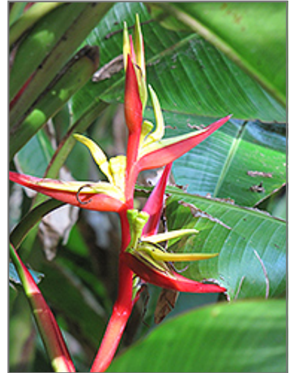
Lobster Claw flowers

When grown indoors, Lobster Claw can be expected to grow to be about 8 feet tall at maturity, with a spread of 6 feet. It grows at a slow rate, and under ideal conditions can be expected to live for approximately 10 years. This houseplant will do well in a location that gets either direct or indirect sunlight, although it will usually require a more brightly-lit environment than what artificial indoor lighting alone can provide. It does best in average to evenly moist soil, but will not tolerate standing water. The surface of the soil shouldn't be allowed to dry out completely, and so you should expect to water this plant once and possibly even twice each week. Be aware that your particular watering schedule may vary depending on its location in the room, the pot size, plant size and other conditions; if in doubt, ask one of our experts in the store for advice. It is not particular as to soil type or pH; an average potting soil should work just fine.