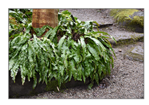
Hart's Tongue Fern

This variety is unusual in that it has simple, undivided fronds that are up to 2 feet long; yellowish and stunted in full sun; luxurious green foliage is a welcome addition to the garden as a groundcover