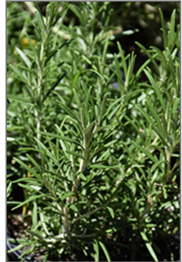
Hill Hardy Rosemary foliage

Hill Hardy Rosemary features dainty spikes of lightly-scented blue flowers at the ends of the branches from late spring to mid summer. It has attractive dark green evergreen foliage. The fragrant needles are highly ornamental and remain dark green throughout the winter.