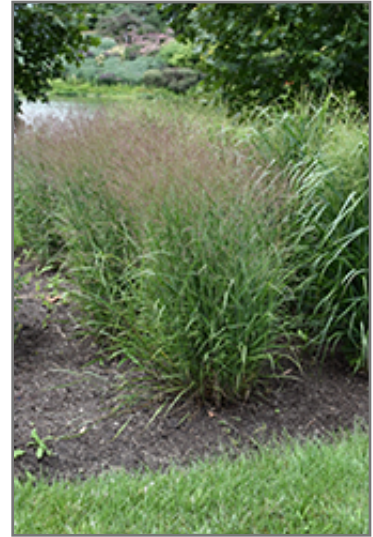
Purple Tears Switch Grass in bloom

This impressive selection forms a narrow, upright clump of striking light green leaves; airy, gray colored plumes appear in mid-summer, followed by splendid purple seed heads; perfect as a landscape accent, or along borders