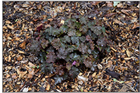
Blackbird Coral Bells