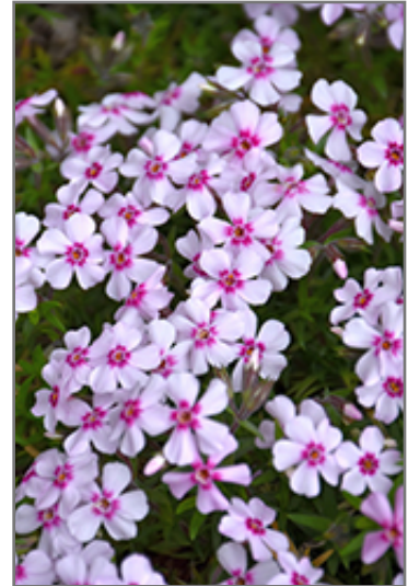
Coral Eye Moss Phlox flowers