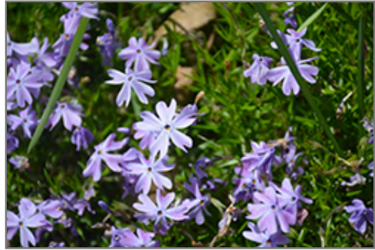
Blue Hills Moss Phlox flowers

Blue Hills Moss Phlox is recommended for the following landscape applications;