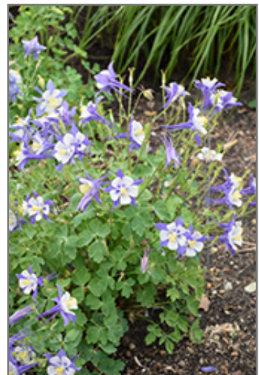
Songbird Blue Jay Columbine in bloom