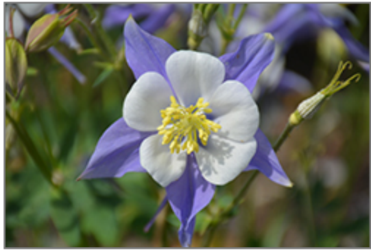
Songbird Blue Jay Columbine flowers