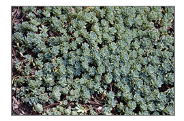
Gray Stonecrop