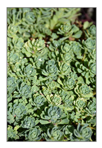
Gray Stonecrop foliage